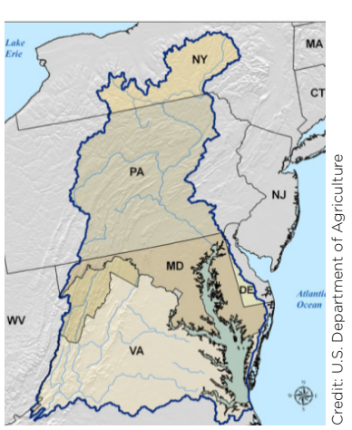
The Chesapeake Bay watershed.

The Chesapeake Bay watershed stretches across 64,000 miles and includes six different states as well as the District of Columbia. Encompassing 140 major rivers and streams as well as 11,684 miles of shoreline, precipitation that falls within this watershed makes its way ultimately towards the Chesapeake Bay. Within the watershed, a variety of land uses from forested areas to agricultural lands to urbanized areas impact the health of its rivers, lakes, streams, and coastlines. Precipitation falling on agricultural lands can pick up pollutants such as pesticides or nutrients and sweep them untreated into rivers and streams. In urban or suburban areas, rainwater is unable to infiltrate into hard surfaces such as parking lots or rooftops. As a result, urban runoff flows over these hard surfaces where it picks up pollutants such as heavy metals, sediment, oil, and grease. Large volumes of polluted runoff can either flow untreated directly into local waters or overwhelm the capacity of storm sewers, resulting in sewage overflows in places with combined systems. Polluted runoff is one of the only growing sources of water pollution in the Chesapeake Bay.