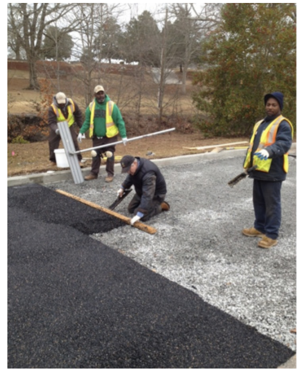
Workers install permeable pavement in Griffin, GA.

An emerging trend among stormwater utilities is the use of a credit system for landowners who install green infrastructure to reduce the stormwater generated on their property. Incorporating a credit allowance serves as an incentive for property owners to use their own funds to build stormwater controls, shifting the burden of paying for this infrastructure service from the public budget to the private sector and allowing property owners to design, install, and maintain controls that are tailored to their individual sites. One additional advantage of this shift may be that far more stormwater controls are built than would be possible through public funding alone. For example, Washington, DC has two different stormwater fees, one through the District Department of the Environment (DDOE) to fund stormwater controls required for the District's MS4 and the Clean Rivers Impervious Area Charge through DC Water to fund stormwater controls required for the District's combined sewer system.<sup>84</sup> In 2010, the District enacted new legislation to base their