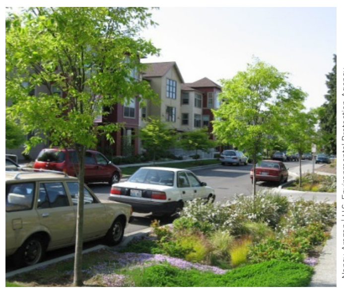
Green street in Seattle, Washington's High Point Neighborhood.

However, maintenance of some green infrastructure can differ from more traditional gray infrastructure in important ways. Green infrastructure practices are often designed as infiltration, runoff reducing, and/or vegetation-based practices. This is a different approach than many more traditional gray infrastructure practices such as curb and gutter systems or culverts that are designed to move stormwater away from roads, parking lots, and buildings as quickly as possible with little pollutant removal and volume or velocity reduction. As a result, while some maintenance activities for gray infrastructure such as detention ponds and catch basins will be similar for green infrastructure practices, others will significantly differ and require other resources and expertise.