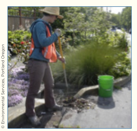
Volunteer with the Green Street Stewards Program in Portland, OR.

Building public support and raising public awareness about green infrastructure can impact the success of these projects. Public support for financing proposals, such as stormwater utilities or infrastructure improvement districts, will be critical to paying for maintenance of green infrastructure. A basic understanding of how green infrastructure practices work and what they look like will also improve public engagement and support for properly maintaining them.