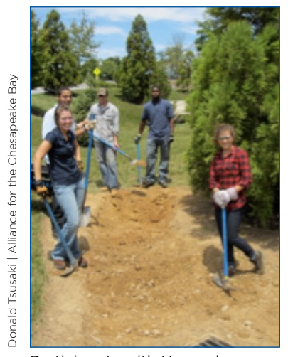
Participants with Howard County's READY Program.

In addition, local governments and outside organizations should consider opportunities to collaborate to strengthen their reach. Partnerships such as the collaboration between Montgomery County and Montgomery College to offer courses on green infrastructure and stormwater management demonstrate how local governments and outside groups can work together to leverage resources and expand their reach. Montgomery