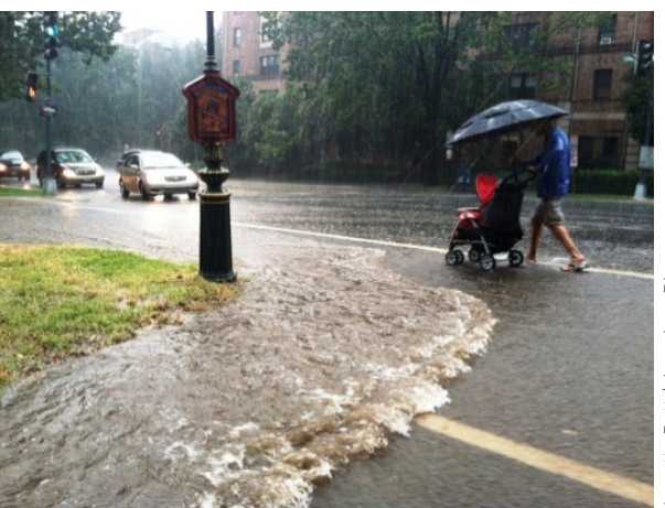
Urban runoff in Washington, DC.

Under section 402(p) of the Clean Water Act, dischargers are required to "reduce the discharge of pollutants to the maximum extent practicable," which has been applied by EPA regulations to mean that permittees must develop and implement stormwater best management practices that meet the six minimum control measures: public education and outreach, illicit discharge detection and elimination, public participation/involvement, construction site runoff control, post-construction runoff control, and pollution prevention/good housekeeping. 27,28,29 The Environmental Protection Agency (EPA) phased in this change by finalizing regulations for larger municipal dischargers, or Phase I communities, by