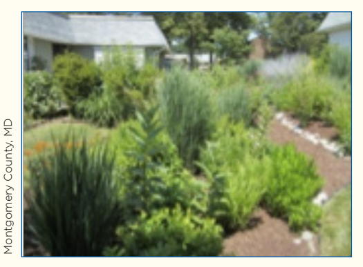
Rain garden constructed under the RainScapes Program in Montgomery County, MD