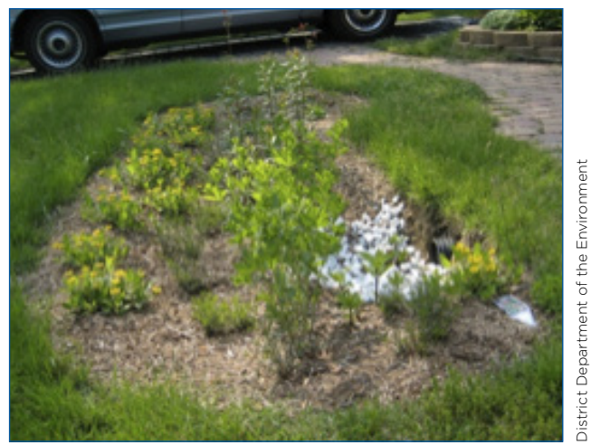
Rain garden built through the RiverSmart Homes Program in Washington, DC.

At the minimum, these standards should include requirements for maintenance agreements between the property owner, contractor, and local government as appropriate for green infrastructure practices as part of the design process that clearly outline maintenance activities and who is responsible for them. These agreements should include the required maintenance activities, frequency of maintenance and inspections, data reporting requirements, notification requirements, easements to ensure reasonable access for municipal staff, and a requirement to prioritize hiring of pre-approved certified contractors or practitioners that have completed training in green infrastructure maintenance through the local government or through an alternative organization. 153, 154 Examples of maintenance agreements designed for green infrastructure